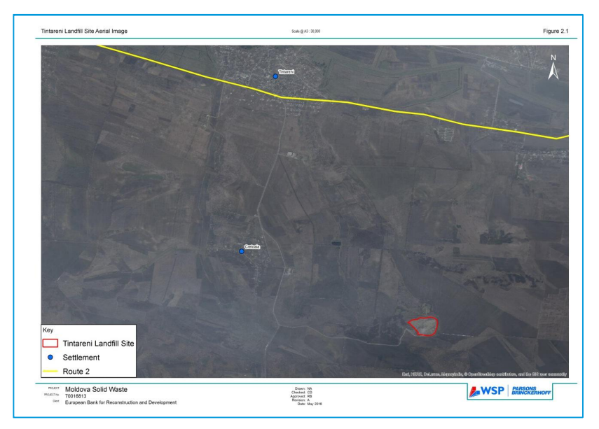
Figure 2-1 Aerial Photograph of the Location of the Tintareni Landfill

The following shows the location and setting of the Tintareni and Ciocana landfill sites: